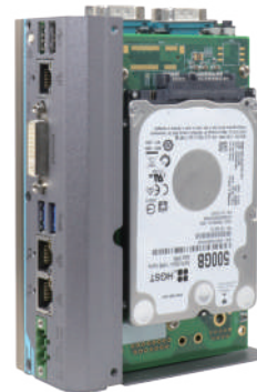
▲ POC-300 with MeziO™ - R11 and 2.5" HDD

** For sub-zero operating temperature, a wide temperature HDD drive or Solid State Disk (SSD) is required.