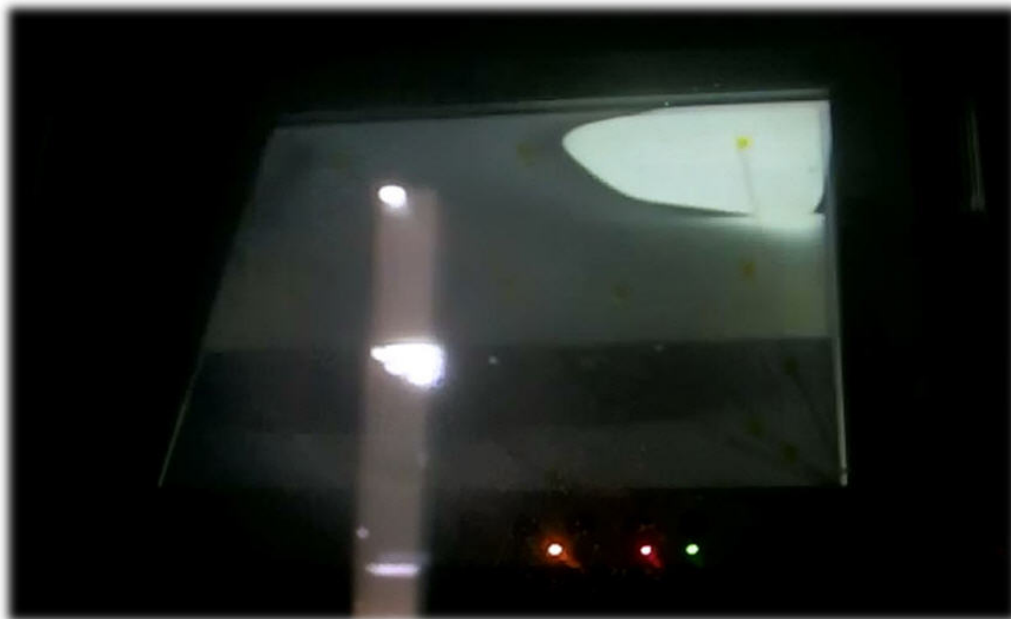
Figure 1: Display distortions: White spots appear at 0°C

Industrial field sites in the petroleum industry are more and more often in remote, distant places exposed to the most extreme cold the earth has to offer, and the computer systems which serve them must be capable of reliably tolerating these extreme environments. Unfortunately, industrial-grade panel PCs that are used in extremely low temperatures will typically have serious problems. Freezing cold causes display distortions like white spots and LCD motion blur, and corrupts the output of onboard components in unpredictable ways. For most platforms, system stability can't be guaranteed until the average temperature rises to 0°C. In many ocean and winter environments, however, reaching this baseline temperature cannot occur without mechanical help of some sort, and makeshift workarounds invariably leave operators frustrated and impatient. For this reason, an onboard, automated heating system is a key improvement for systems built to withstand outdoor temperature extremes.