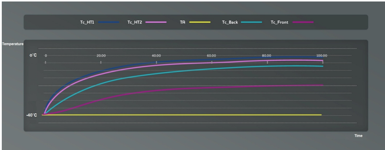
Figure 2: The thermal curve of a computer heated from -40°C to 0°C over 40 minutes—notice its consistency. X-axis is time (40 minutes), Y-axis is temperature.

experience as temperature drops will unpredictably alter PWM output at very low temperatures, distorting the relationship between PWM output and the heating element in unpredictable ways that can corrupt or even damage the heating system. For these reasons, an independent heat profile defined in terms of PWM duty cycles must be derived in the laboratory for each platform. This is the constant, labeled \chi (chi) in the above formula.