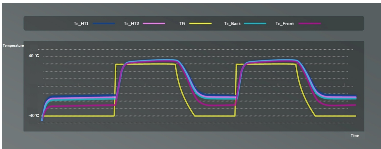
Figure 4: Temperature response times over a period of two heat cycles totaling nearly 40 hours of continuous operation.

Tc_HT1 = Heater Board A Tc_HT2 = Heater Board B Tc_Back = Temp. of enclosure’s back panel (computer) Tc_Front = Temp. of enclosure’s front panel (LCD panel) TA = Baseline environmental (ambient) temp.